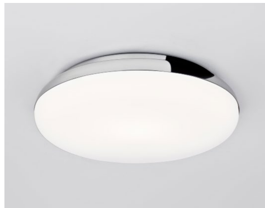
CODE: 1133002 (0586) FINISH: POLISHED CHROME