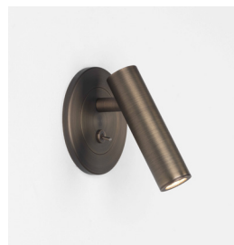
CODE: 1058088 FINISH: BRONZE

TO MAINTAIN THIS PRODUCT TO ITS BEST CONDITION, PLEASE VIEW OUR CARE AND CLEANING GUIDE ON THE SUPPORT SECTION OF THE ASTRO WEBSITE.