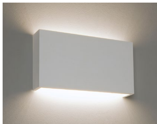
CODE: 1325001 FINISH: PLASTER

TO MAINTAIN THIS PRODUCT TO ITS BEST CONDITION, PLEASE VIEW OUR CARE AND CLEANING GUIDE ON THE SUPPORT SECTION OF THE ASTRO WEBSITE.