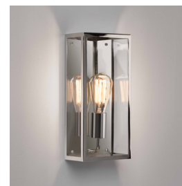
CODE: 1183008 FINISH: POLISHED NICKEL