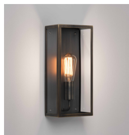
CODE: 1183011 FINISH: BRONZE

TO MAINTAIN THIS PRODUCT TO ITS BEST CONDITION, PLEASE VIEW OUR CARE AND CLEANING GUIDE ON THE SUPPORT SECTION OF THE ASTRO WEBSITE.