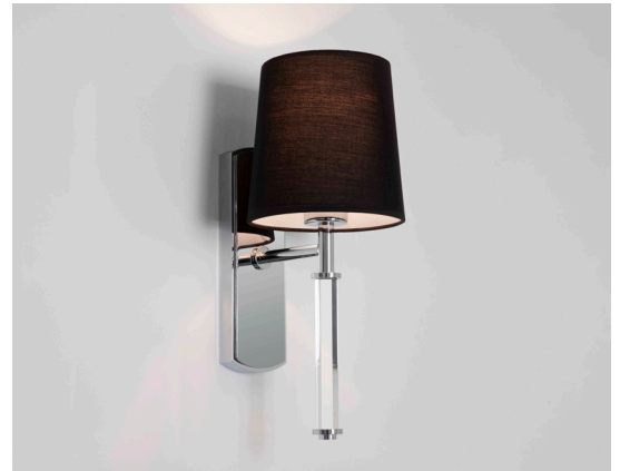
CODE: 1313002 FINISH: POLISHED CHROME

TO MAINTAIN THIS PRODUCT TO ITS BEST CONDITION, PLEASE VIEW OUR CARE AND CLEANING GUIDE ON THE SUPPORT SECTION OF THE ASTRO WEBSITE.