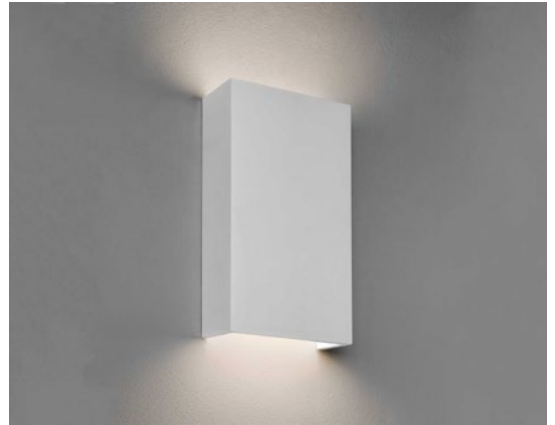
CODE: 1325006 FINISH: PLASTER

TO MAINTAIN THIS PRODUCT TO ITS BEST CONDITION, PLEASE VIEW OUR CARE AND CLEANING GUIDE ON THE SUPPORT SECTION OF THE ASTRO WEBSITE.