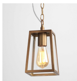
CODE: 1306006 FINISH: ANTIQUE BRASS

THIS PRODUCT IS NOT SUITABLE FOR INSTALLATION WITHIN FIVE MILES OF THE COAST. FOR THESE ENVIRONMENTS, PLEASE FILTER PRODUCTS ON THE ASTRO WEBSITE BY 'COASTAL'.