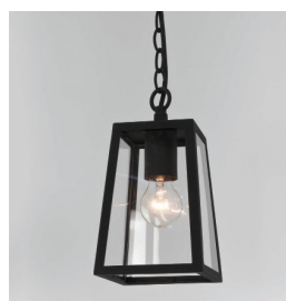
CODE: 1306003 FINISH: TEXTURED BLACK