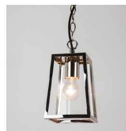
CODE: 1306004 FINISH: POLISHED NICKEL