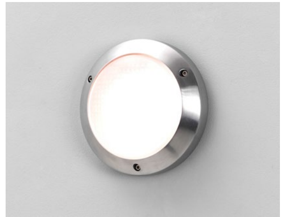
CODE: 1039005 FINISH: POLISHED ALUMINIUM

TO MAINTAIN THIS PRODUCT TO ITS BEST CONDITION, PLEASE VIEW OUR CARE AND CLEANING GUIDE ON THE SUPPORT SECTION OF THE ASTRO WEBSITE.