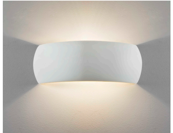
CODE: 1299002 FINISH: CERAMIC

TO MAINTAIN THIS PRODUCT TO ITS BEST CONDITION, PLEASE VIEW OUR CARE AND CLEANING GUIDE ON THE SUPPORT SECTION OF THE ASTRO WEBSITE.